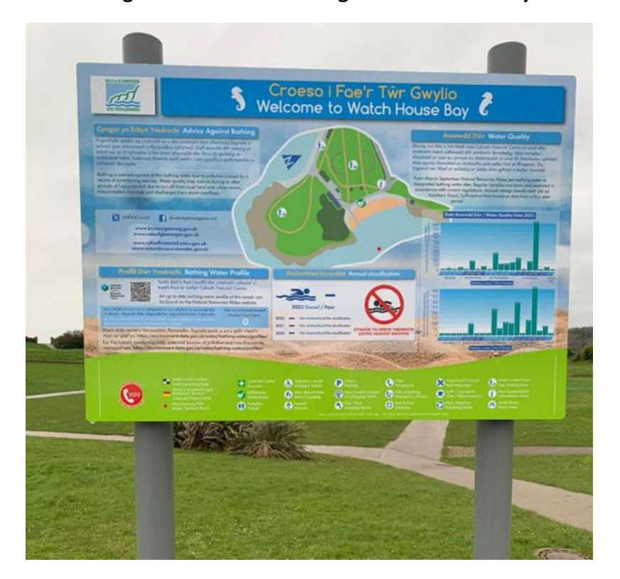
Figure 3 - Bathing Water Information Sign Watch House Bay

no prohibition on use of the beach. Figure 3 below shows the sign at Watch House Bay as an example of the signage installed.