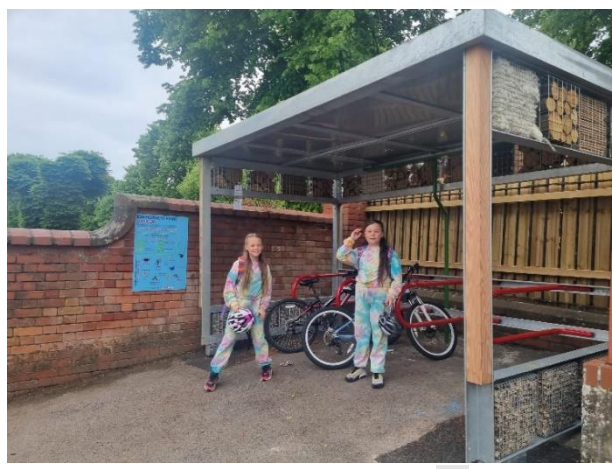
Figure 3. Romilly Primary – Green Roof Shelter