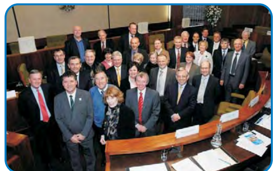
Scrutiny Committees members with various stakeholders prior to the meeting held on 24/03/09 to discuss the impact of the current economic slowdown.

Further work on engaging the public has also been prepared with the development of Scrutiny leaflets devised by the Scrutiny and Committee Services Section, copies of which are available at various Council establishments, libraries and via the Council's website.