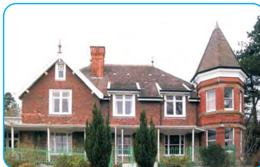
Bryneithin Residential Home, Dinas Powys

This case study illustrates the way in which key stakeholders and the public can have an involvement in the work of the Council by providing their views, observations and comments on issues prior to the Council making its final decision on a matter.