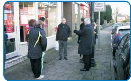
Members and Officers on a site visit to Penarth 20/01/09

In light of unsuccessful funding bids to the Welsh Assembly Government the Scrutiny Committee (Economy and Environment) took the decision to continue addressing how improvements and regeneration could be progressed in town centres within the Vale. To this end a Task and Finish Group was established to undertake a review in respect of Penarth Town Centre.