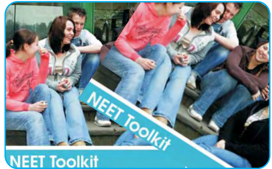
NEETS Toolkit booklet

This study illustrates how Scrutiny had a direct impact on the work of the Executive by helping shape policies that need to engage a range of agencies to provide the variety of support required to meet the disparate needs of young people not in education, employment or training.