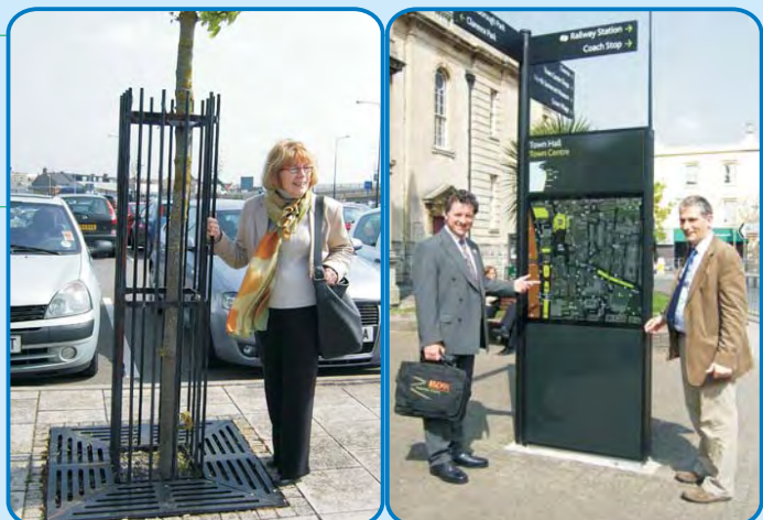
Members visit Weston Super Mare on 23/04/09

Visit to Weston Super Mare and Clevedon (Local Authority).