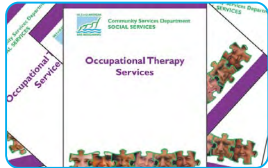
Occupational Therapy Services booklet

The Scrutiny Committee (Social Care and Health) established an Occupational Therapist Task and Finish Group with the purpose of facilitating an examination of the Occupational Therapy Service and to assess the current provision of occupational therapists within the Vale of Glamorgan.