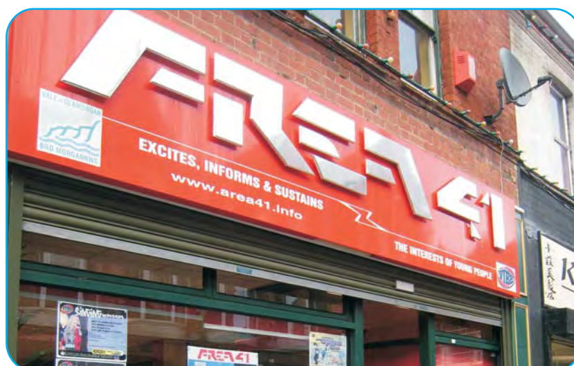
Area 41 Youth facility building Holton Road, Barry

The 14 recommendations of the Scrutiny Committee are on the Council's website at http://www.valeofglamorgan.gov.uk/our_council/council/minutes,_agendas__reports/reports/cabinet/2009/09-05-20/references/review_of_children_neet.aspx