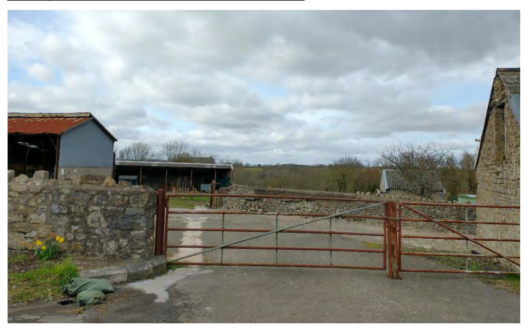
Site photograph 3 - View toward site from south (from Porthkerry/ Cliff Farm)