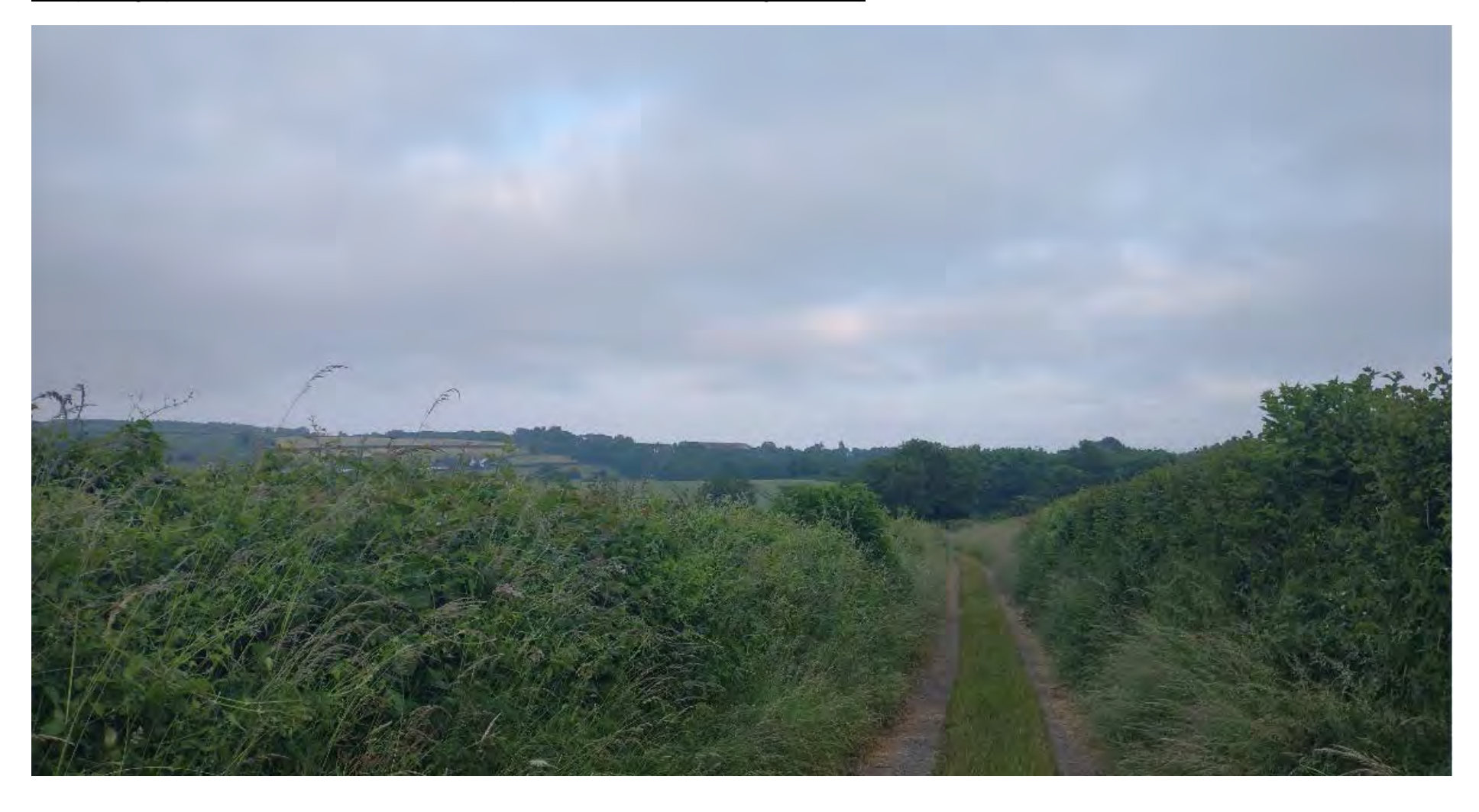
2019/00871/FUL – Land at Model Farm, Port Road, Rhoose