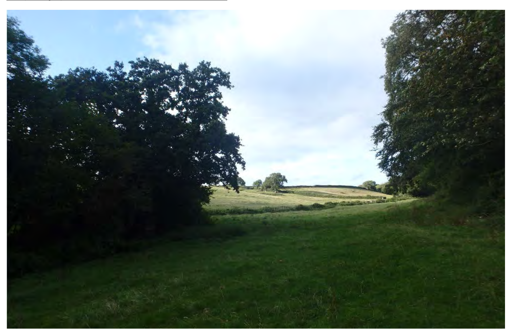
Site photograph 5 – view from woodland within 'Area B'