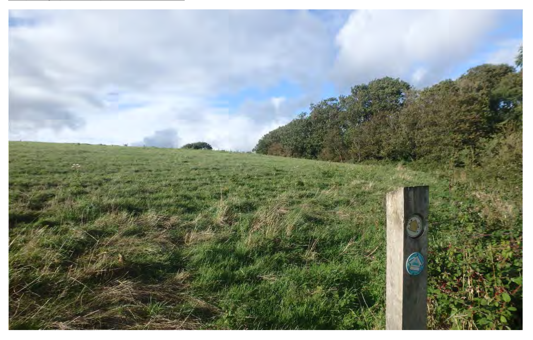
2019/00871/FUL – Land at Model Farm, Port Road, Rhoose