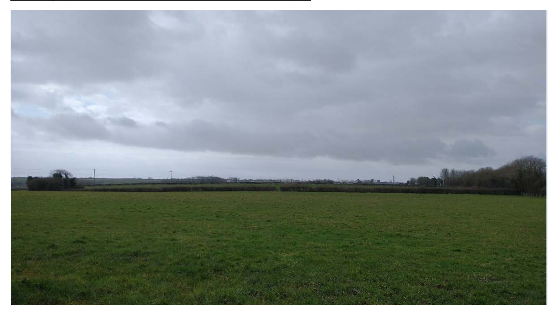
<u>Site Photograph 8 – View across site from footpath toward Model Farm (west)</u>