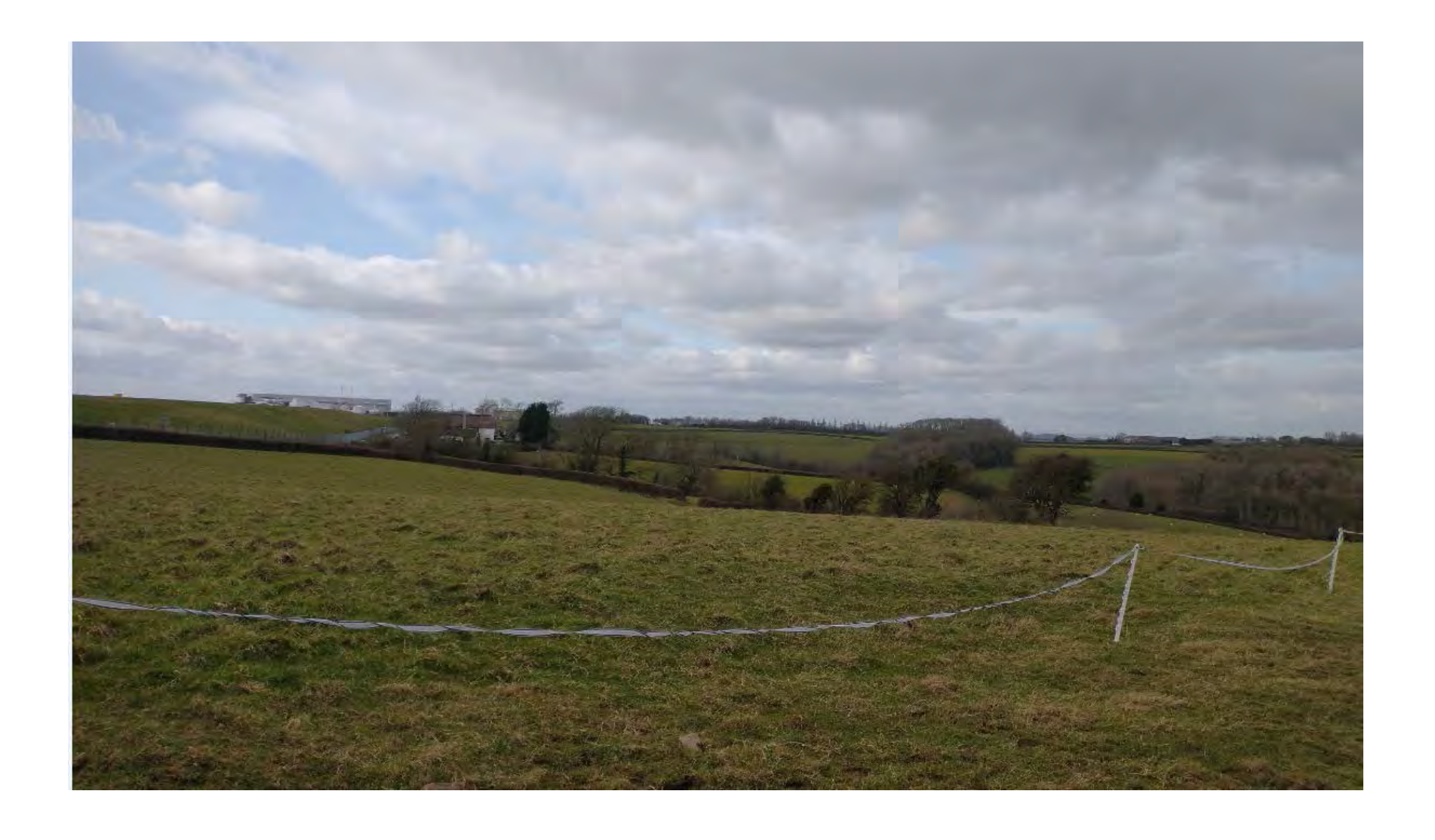
2019/00871/FUL – Land at Model Farm, Port Road, Rhoose