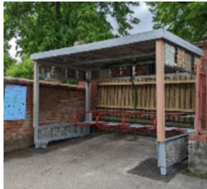
Romilly Primary School – green roof shelter

FY23/24 Local Nature Partnership fund - £5,000 awarded to match fund green roof shelter at Romilly Primary School.