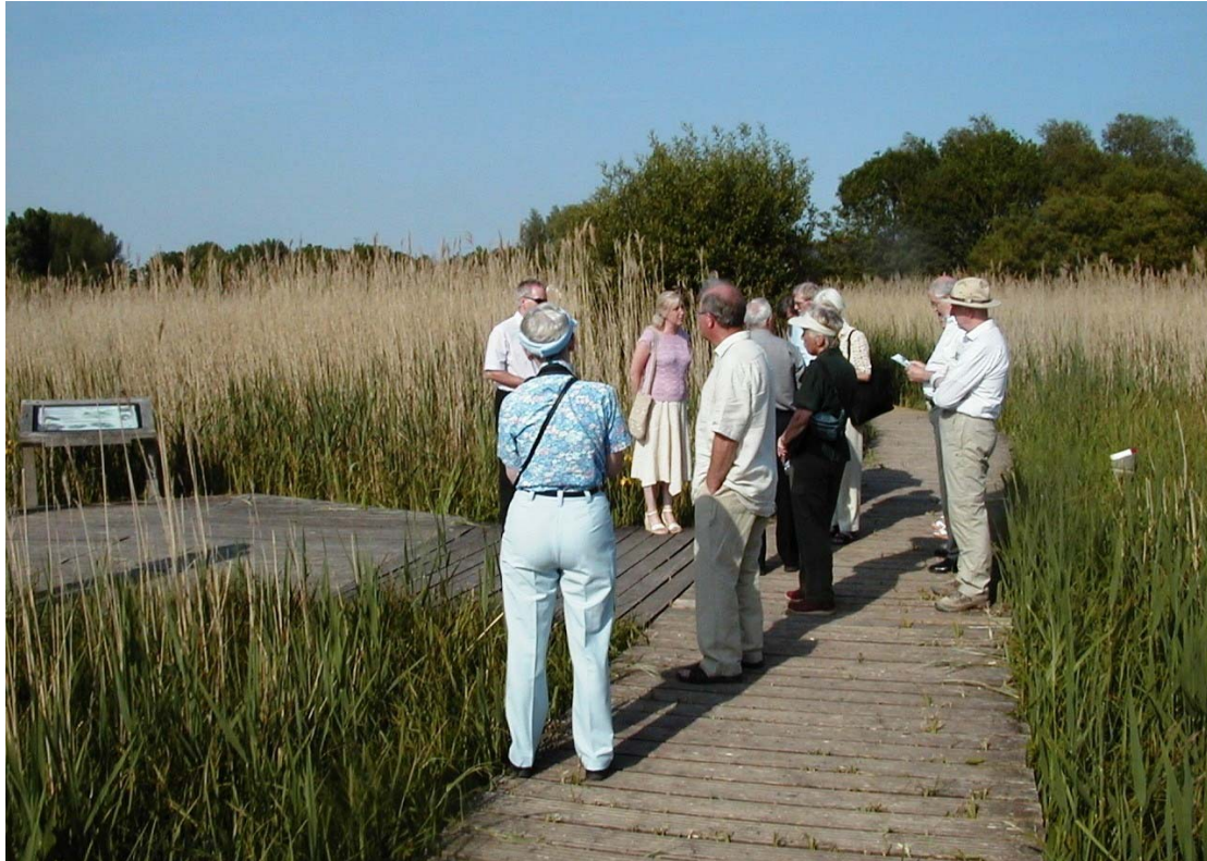
(Photograph – LAF Members and officers prior to the June 2006 meeting at Cosmeston Lakes Country Park.)

Again, at the June 2006 meeting, the Forum was advised by the Deputy Chairman that, in conjunction with the Cardiff Institute of the Blind, a walk had been undertaken to the Cosmeston Lakes Country Park, with a view to ascertaining how people with poor sight could cope with country walks. As a result, it was agreed that information for the visually impaired on walks would be addressed within the preparation of the Rights of Way Improvement Plan (ROWIP).