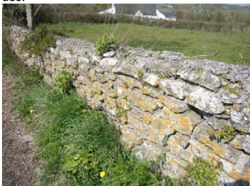
The stone wall between Church Farm and the Church.