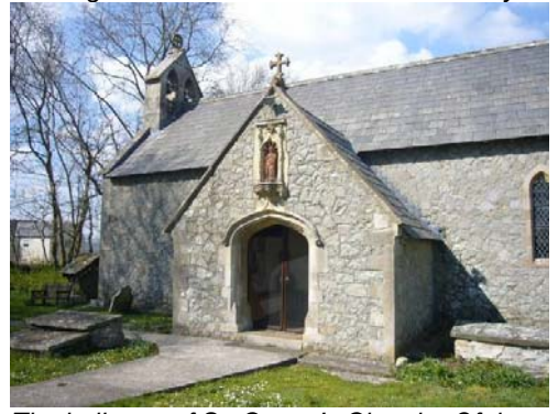
The bell-cote of St. Canna's Church. Of the two bells, one is probably medieval, the other is dated 1861.