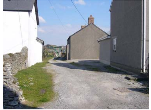
Haphazard layout and unmetalled side roads are a reminder of the agricultural origins of the village.