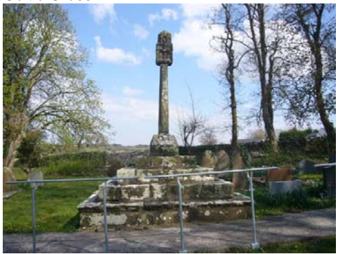
Medieval Churchyard Cross