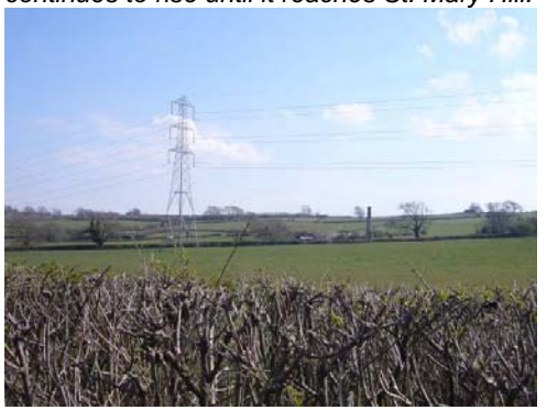
Looking southwards the view is marred by pylons. A 19<sup>th</sup> century lead mine chimney can be seen to the right of centre.