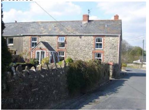
The use of red brick suggests that this building was constructed in the 19<sup>th</sup> century.