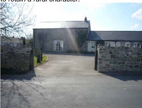
Former farm buildings, for example this granary, have been converted to residential use.