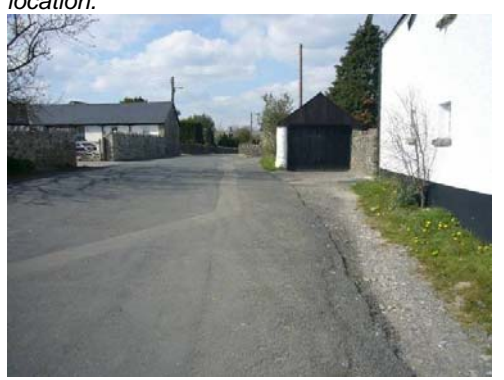
The absence of kerbs and pavements contributes to the rural character of the conservation area.