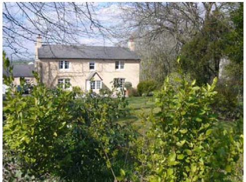
The Old Rectory.