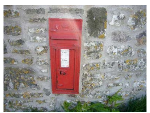
Small features such as this Victorian letter box add to local distinctiveness and should be preserved