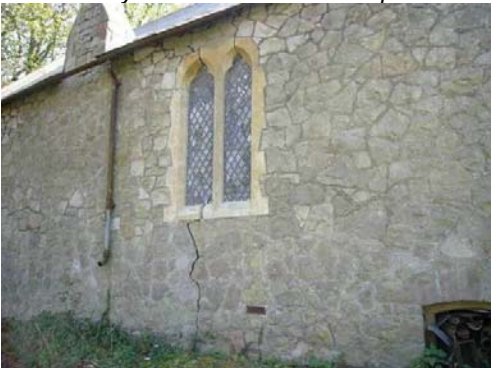
Cracks in the church's masonry are a cause for concern.