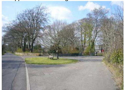
Small green beside the entrance to St. Canna's churchyard.