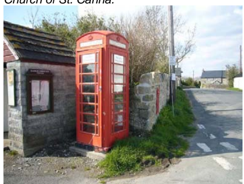
Telephone Call Box.