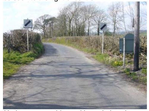
Hedgerows provide rural boundaries along the approach to the village.