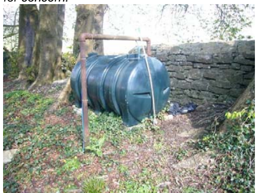
This oil tank might be concealed by a screen.