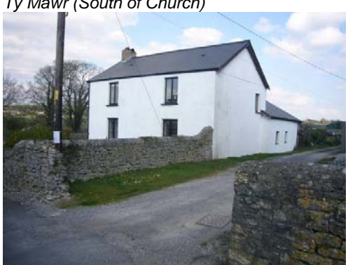
Stone walls are a distinctive feature of the conservation area.