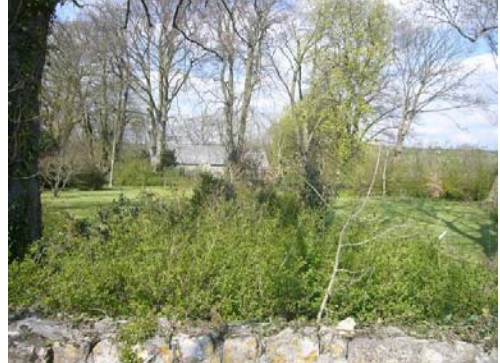
The church is surrounded by a band of trees

Stone boundary walls are a particular feature of the area – the one on the eastern side of the road between Church Farm and the entrance to the churchyard has an aged quality arising from colourful lichen. West of The Old Rectory is a rectangular garden partly enclosed by a well-constructed stone wall.