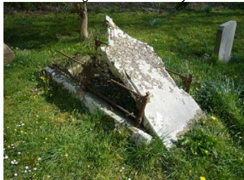
Some gravestones are in need of attention.