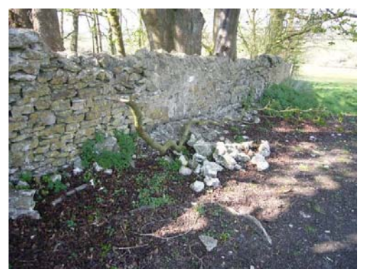
The churchyard wall is in need of repair.