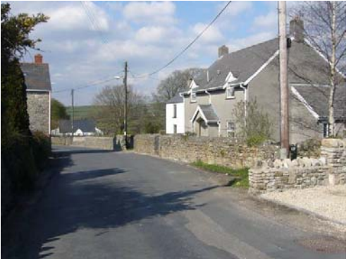
Roadside stone walls and grass verges help to retain a rural character.