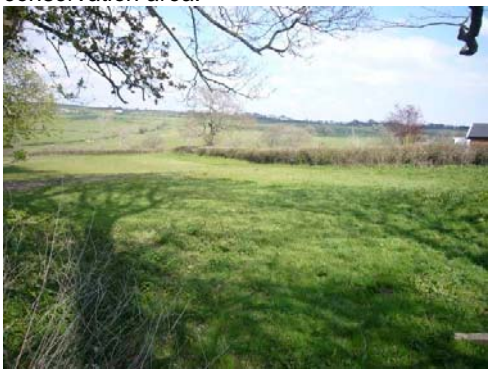
An open field, through which runs a public footpath, is vital to the rural setting of the churchyard.