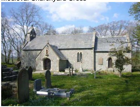
Church of St. Canna.