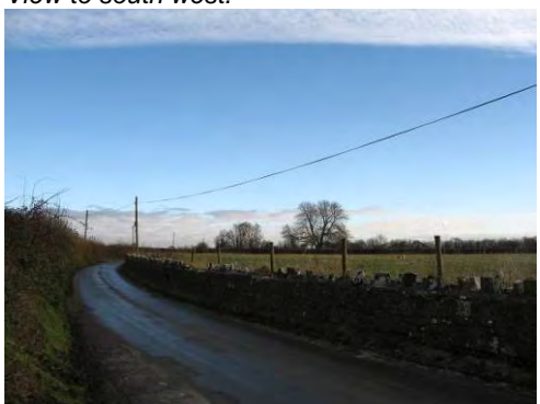
Field to north east.