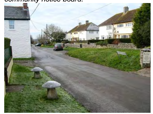
The centre of Llanbethery.