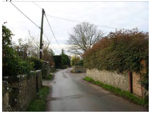
Local limestone is often used in the construction of boundary walls.