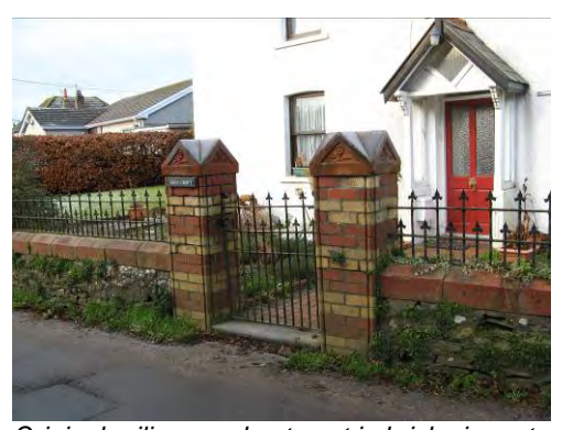
Original railings and gate set in brick piers at