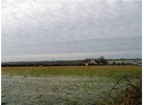
View to south west.