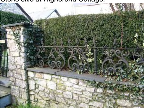
Ornate railings at Llanbethery Farm.