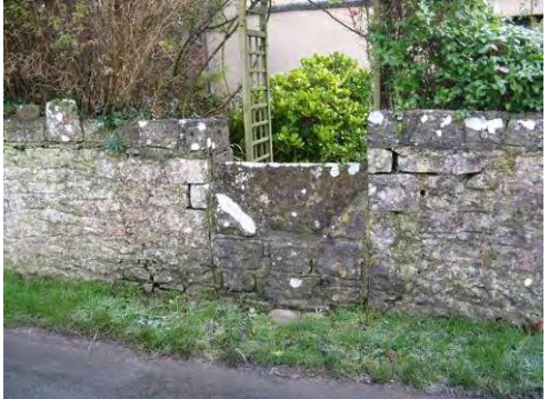
Stone stile at Higherend Cottage.