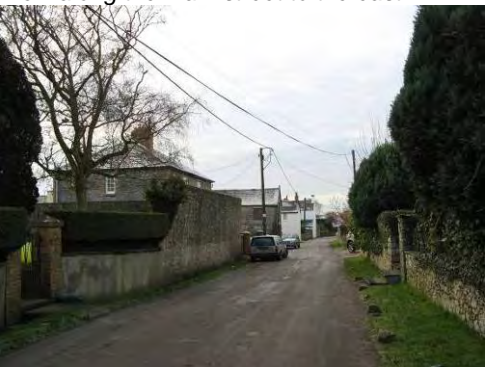
View along the main street to the west.