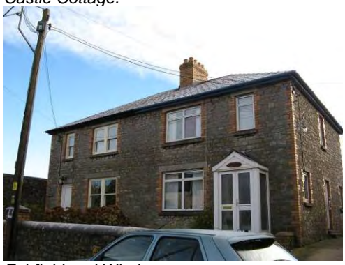
Fairfield and Windways.