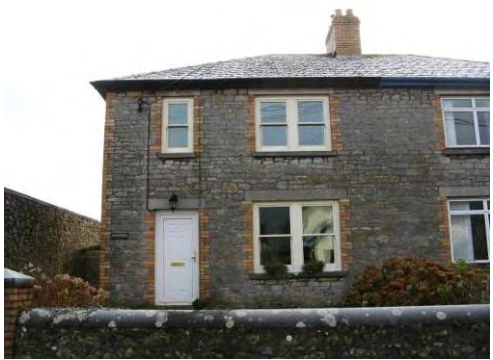
Modern, but well detailed windows on Windways.