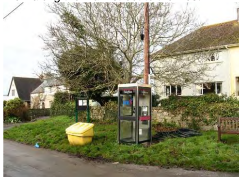
Grass verge, telephone call box and community notice board.