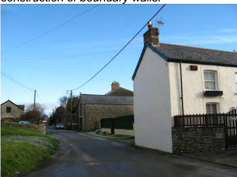
The village has a strong linear form.