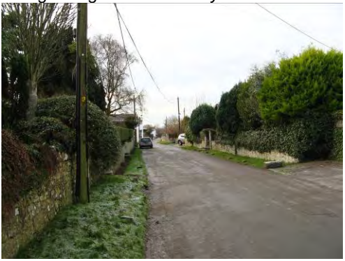
Wirescape can be visually dominant.