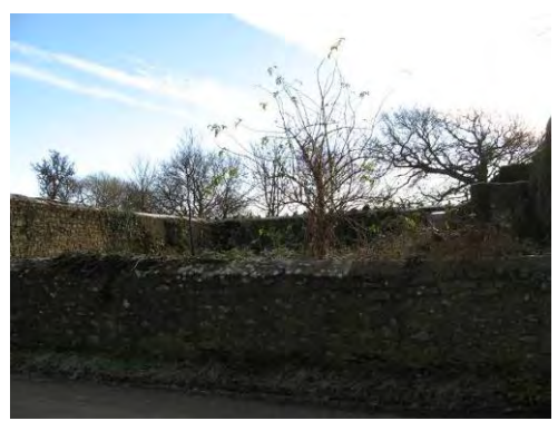
Overgrown garden next to Ty Mawr.