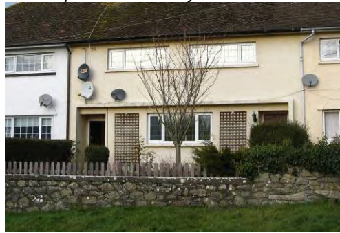
Here a large number of satellite dishes dilute the character of the area.