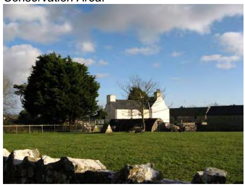
View to Flemingston Court Farm from the north.