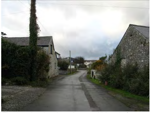
The hamlet developed around historic farms.