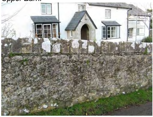
Stone walls outside Y Hen Fferm Dy.