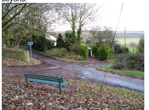
The rural lane in the southern part of the Conservation Area.