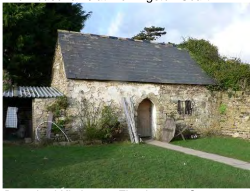
Detached Kitchen at Flemingston Court.