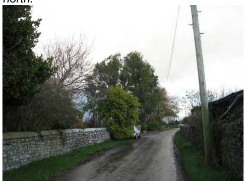
The lane in the middle of the village.