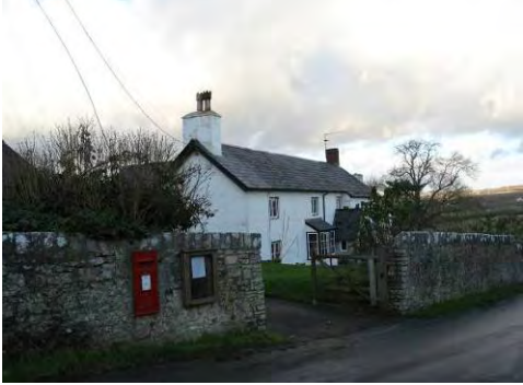
Y Hen Fferm Dy.