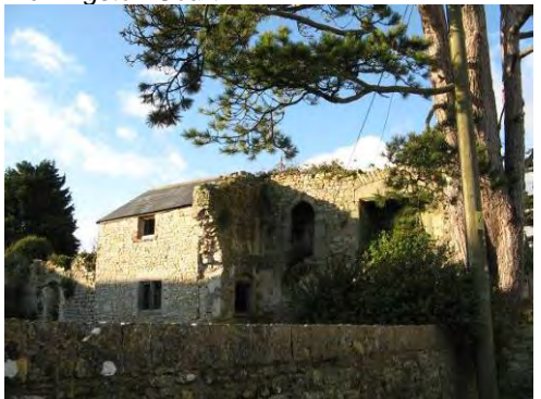
The House ruins at Flemingston Court.