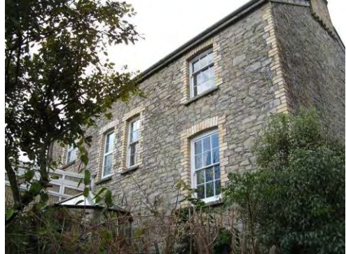
Unlisted 19<sup>th</sup> century cottages on edge of the village (New Cottages)