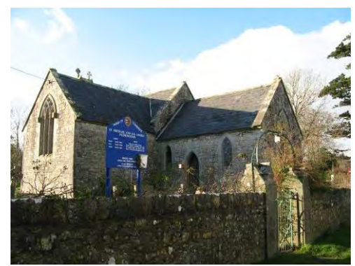
St. Michaels Church