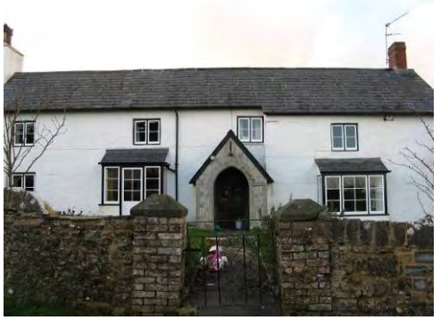
Y Hen Fferm Dy.