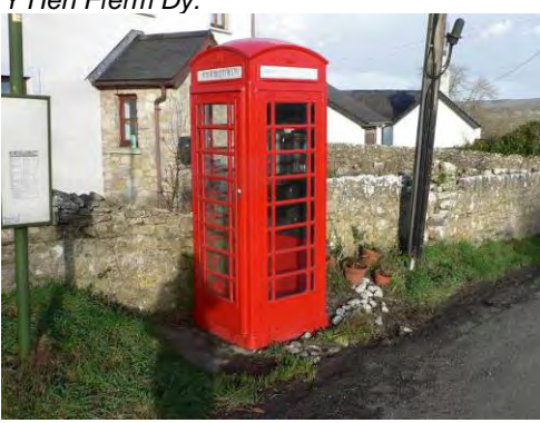
Telephone Call Box.