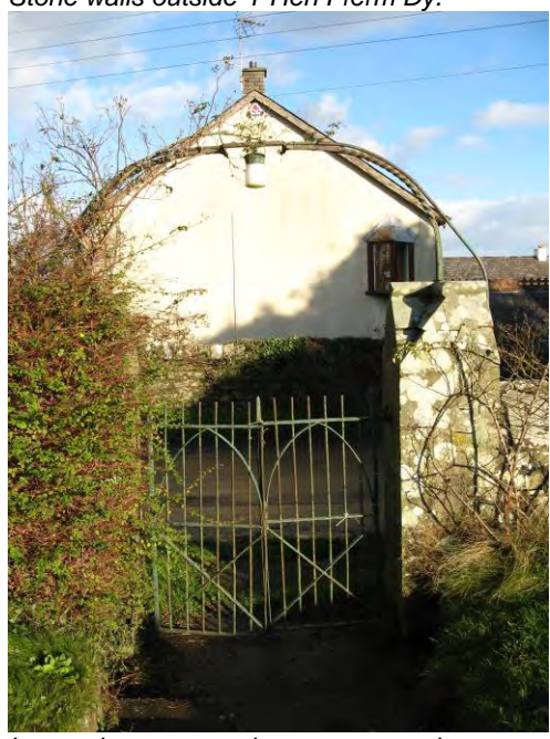
Interesting gates at the entrance to the churchyard.