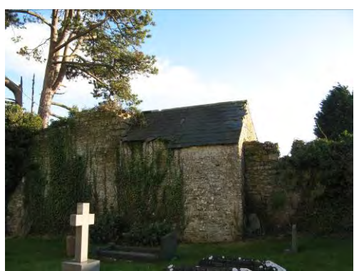
Ivy can cause significant damage to historic buildings.