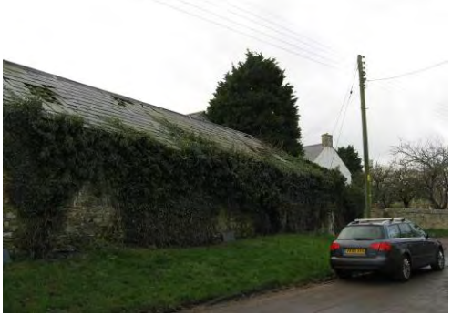
These outbuildings are in a poor condition.