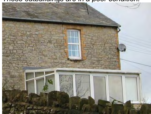
uPVC windows, prominent conservatories and satellite dishes can detract from the special character of otherwise positive buildings.