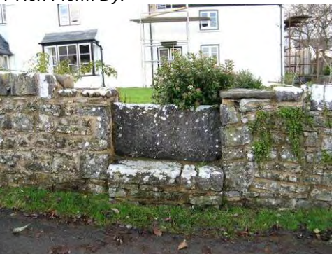
Stone stile outside Y Hen Fferm Dy.