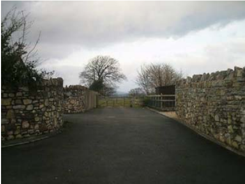
Inappropriate 'suburban' development.