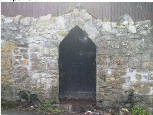
Arched gateway at the Old Rectory.