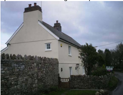
Former farmsteads form the basis of the hamlet.