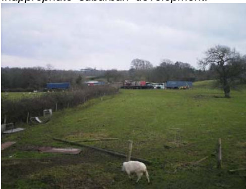
Incongruous haulage yard.