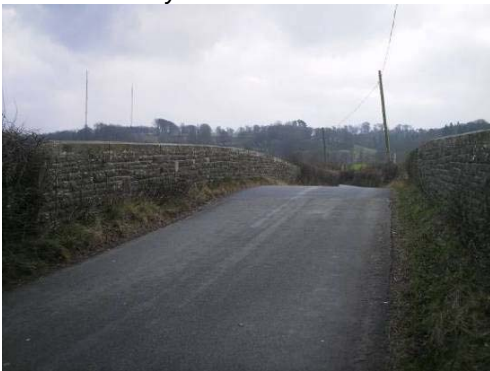
Former railway bridge