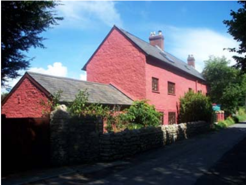
Ty Llwyd features a very distinctive pink colour wash and is situated at the very heart of the village.