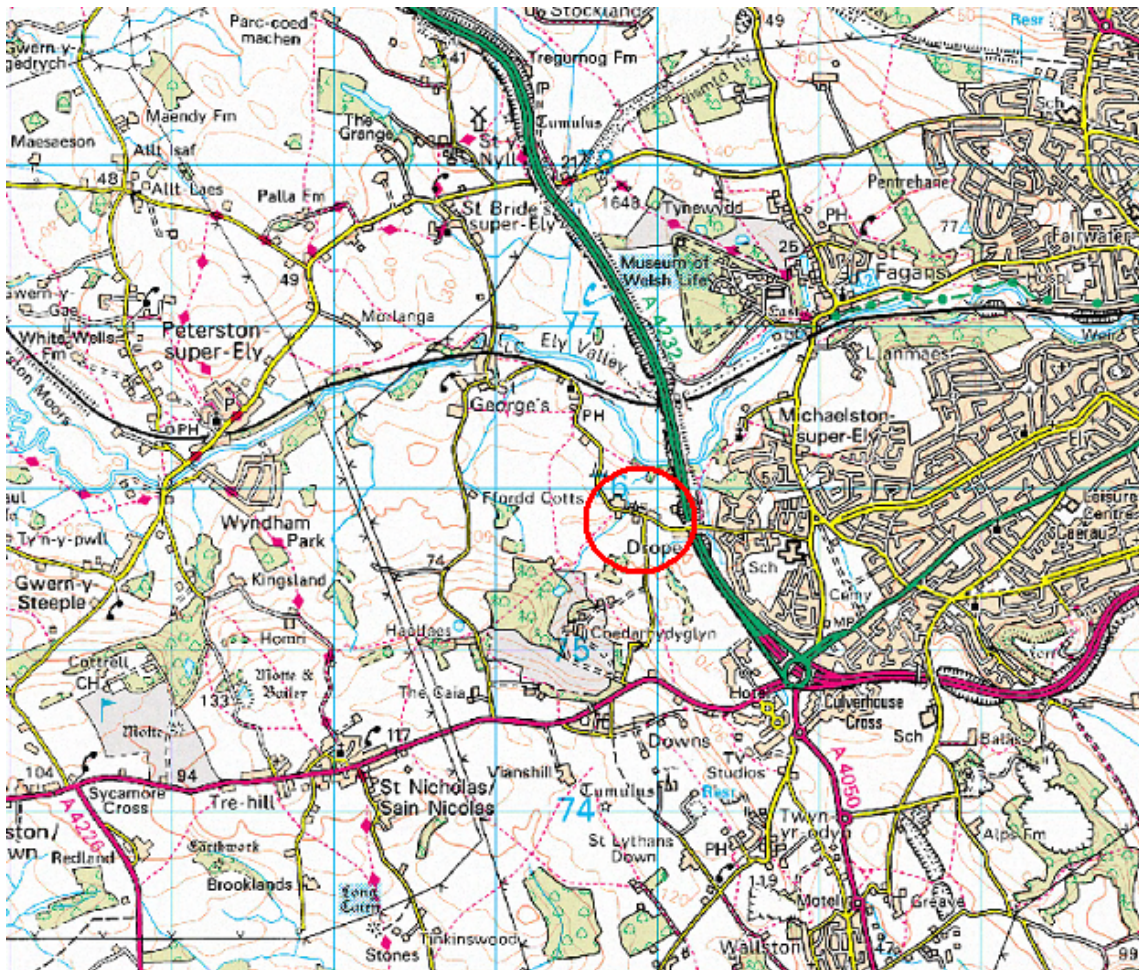
OS Extract showing context of Drope

The Drope Conservation Area is located 1km north-west of Culverhouse Cross and is immediately west of the city of Cardiff. The conservation area has a rural setting surrounded by open countryside.