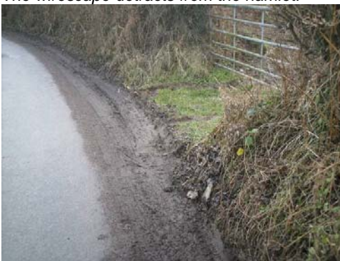
Some verges are being eroded.