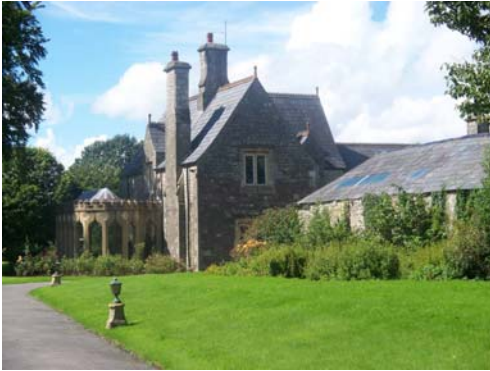
The Old Rectory