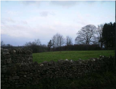
Stone boundary walls and grass verges add to the character of the conservation area.