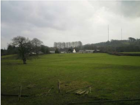
Looking east into the hamlet.