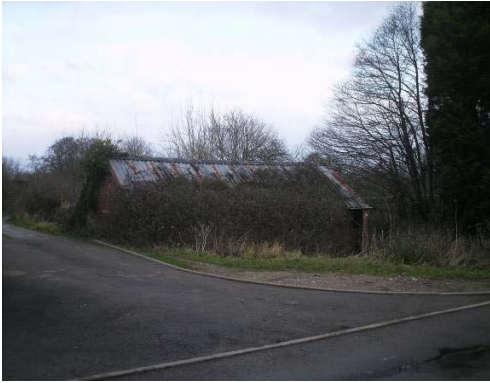
Spaces between buildings are important.