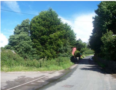
Important tree groups