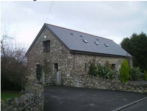
Former barn at Drope Farm, now converted for residential use.