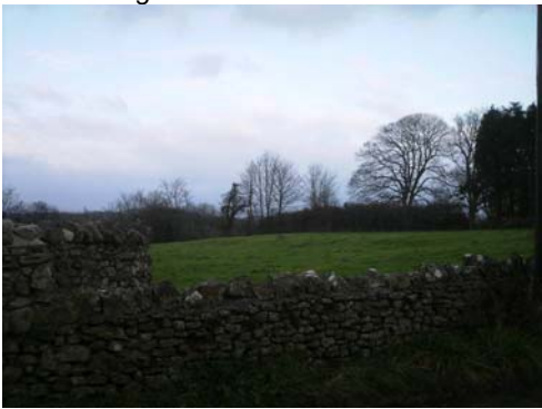
Trees, hedgerows and walls play an important part in the biodiversity in the area.

Drope Farm is an example of a two-unit, end-entry house with hall and inner room probably dating from the sixteenth century. It has been subsequently modernised and extended but still retains its character. Four of its former barns remain, although these were converted into residential dwellings in the late 1990's.