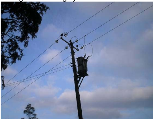
The wirescape detracts from the hamlet.